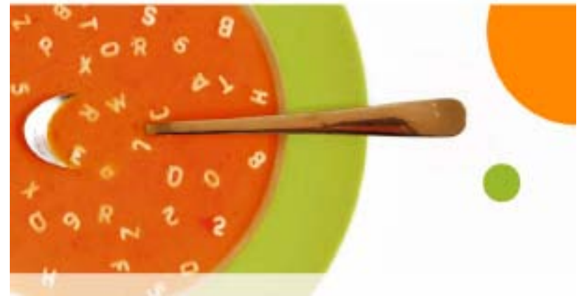
Teil 1 – Berliner Qualitätskriterien