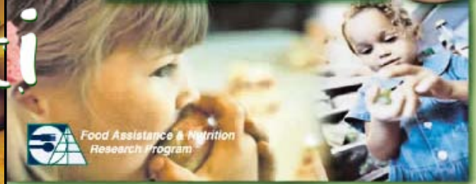
Food Assistance & Nutrition Research Program